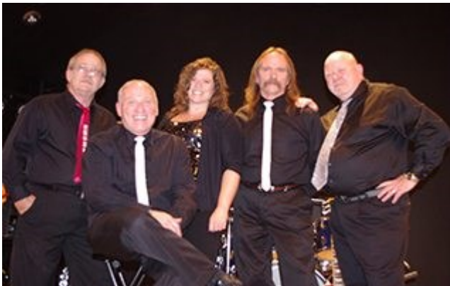
The Big Zephyr presents a Linda Ronstadt Tribute