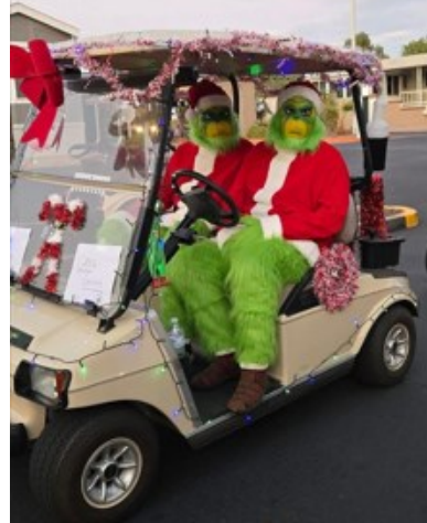
Meet our GVR Grinches!

NO ANNUAL FEE TO USE THE COMPUTER CLUB. We are here to help you with your own device. Help you use Election Buddy! Help you learn how to use the Condo Web. Check your email, play a game or surf the net. Come by with your laptop or phone, you can link to the printer. We offer print and photocopying for CASH.