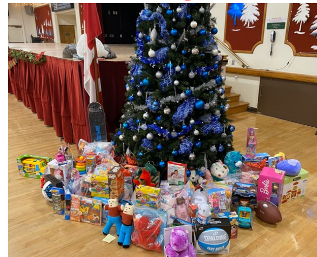
This years Forgotten Angel donations. Thank you to everyone that participated!! You are the true angels!!!!