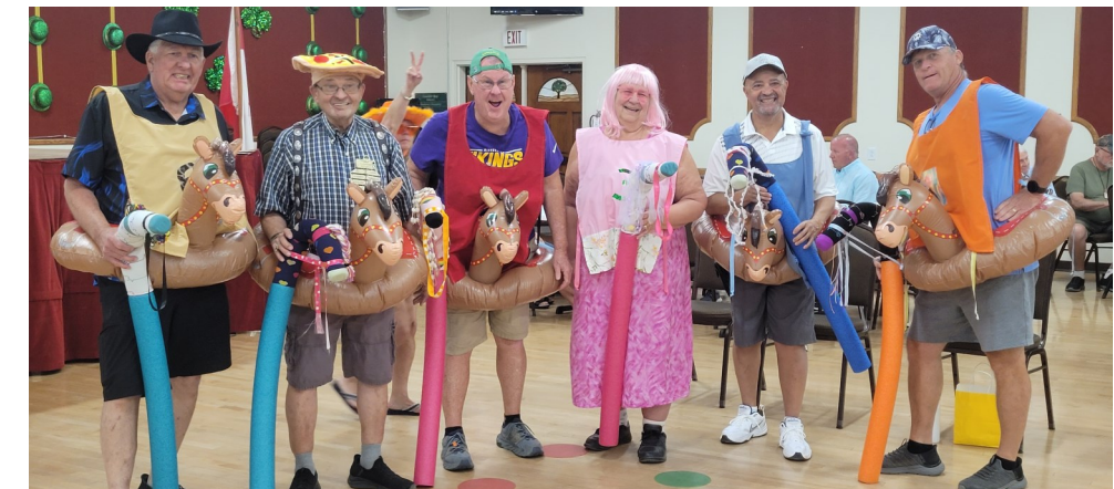
Last Derby Night of the season-five stallions and a filly

Greenfield Village Resort 111 S. Greenfield Rd. Mesa, AZ 85206